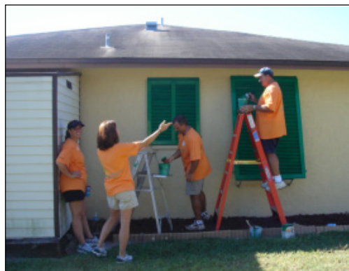
Comcast volunteers paint the shutters on the LVLC office building on "Comcast Cares" Day.