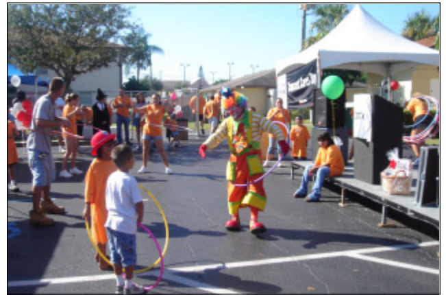
A hula hoop contest made the Family Reading Festival on "Comcast Cares" Day fun for the children.