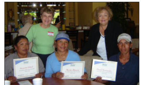
Students in the Pelican Sound Golf and River Club literacy program proudly display their literacy certificates in front of their tutors.

This year's Annual Appreciation Dinner for tutors, students and friends of Literacy Volunteers will take place Friday, June 8, from 5:30 to 8:30 p.m. at Epiphany Episcopal Church, 2507 Del Prado, Cape Coral. This year's theme is " Celebrate Diversity! " The annual celebration acknowledges student achievements and thanks tutors for the hours they have donated to advance adult literacy in Lee County.