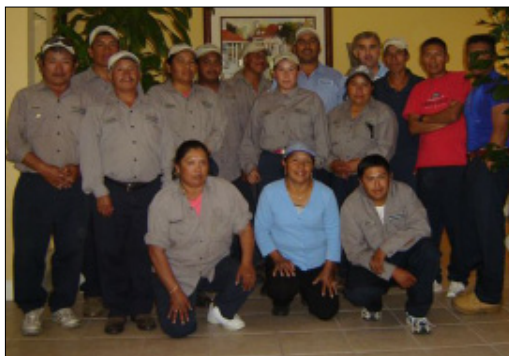
Participants in the workplace literary program at Pelican Sound Golf & River Club celebrate their achievements.

Making a 911 call, food names, and workplace vocabulary may seem like very small steps toward literacy, but we know these steps not only make our students' lives a little easier, but more effective employees.