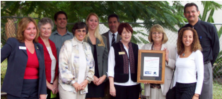
Community friends, board members, Comcast supporters, and LVLC staff enjoy the Open House.

Housing Authority of the City of Fort Myers: LVLC is working with the Housing Authority to develop and offer free English literacy classes to residents who can improve their lives by improving their ability to read and write. Two classes a week are expected to start within a month.